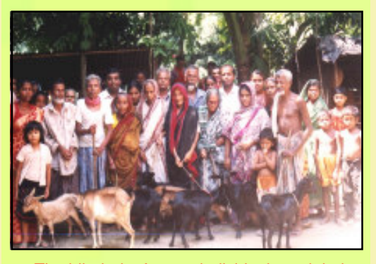
The blind, deaf, mute individuals and their families who were blessed by receiving goats.

Assisting poor families: We have a practical plan to motivate, assist and elevate the desperate families to come out of financial bondage by providing goats. This strategic plan is an expression of Christian love and is earning outstanding results in Bangladesh.