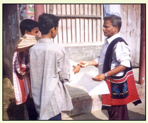
One of the native missionaries distributes gospel literature to the students.

Seminary in the Philippines and at Andrews University in Michigan, USA. At first, I wanted to be a rich lawyer, live in a big house and do great things. However, I got my masters degree in religion. God had other plans. I eventually returned to my home village and organized the native