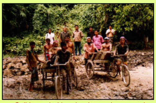
Soil is carried by tricycle to raise ground level to build a flood shelter.