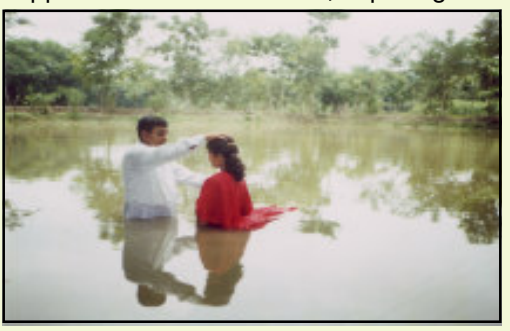
Baptizing new believers

He commands His followers to love one another. Jesus also told His disciples to preach the gospel. Along with other native missionaries, we are now preaching God's love in the remote villages of Bangladesh, distributing gospel tracts and Bibles, extending emergency relief, running elementary schools, providing medical support to the rural destitute, baptizing new