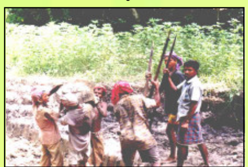
Young people working hard to build a village church.